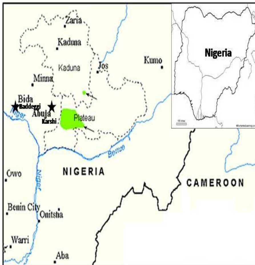
Figure 4: Location of Surveyed Farms in North Central Nigeria